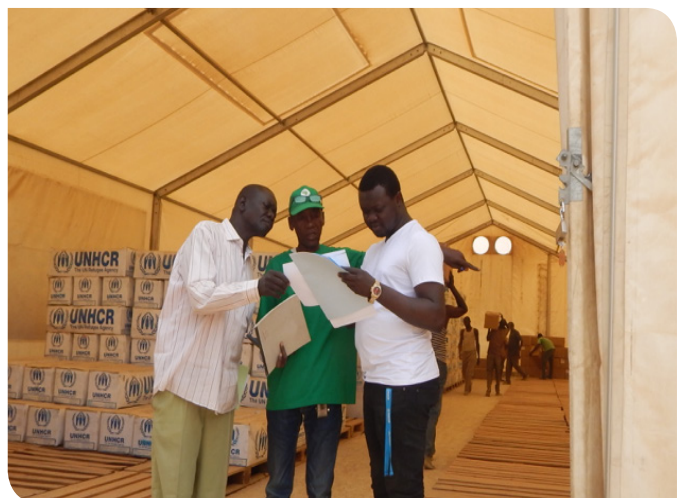
The warehouse team at the AIRD office in N'Djamena, Chad ensure documentation is correct

Drug cold chain management was also undertaken in some of our programs in 2019. In Uganda, guided by the Ministry of Health standards, AIRD continued to support medicine and medical supplies management through establishing and maintaining 2 medical storage facilities. The program transported assorted medicine and medical supplies from these stores to 6 health centers. A total of 1,394,678 refugees / IDPs / asylum seekers and 480,000 members of the host communities were beneficiaries.