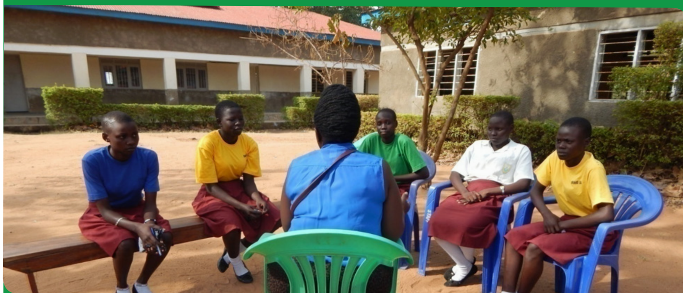
Above: An AIRD staff member checks in on the girls at St. Mary's Assumpta Girls' Secondary School, Arua Uganda

"...I can't figure out how life would have been."