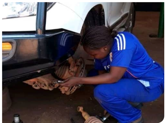
AIRD mechanics and technicians ensure that vehicles and other assets are kept in good condition with minimal downtime

The unique demands faced by workshops in the humanitarian space have become very well understood by our teams. Workshops are able to deliver whether services are required in the context of relief work (high urgency, short durations) or development contexts (low urgency, long durations). Our engineers and technicians are able to provide assistance through strategically located workshops or in situations when they must travel to remote areas to undertake urgent repairs. In Chad alone, repairs/servicing was undertaken 2,933 times on light vehicles and 1,336 times on generators. In the Democratic Republic of Congo, our team ensured that trucks were repaired/serviced on 140 occasions and 780 instances for motorbikes. Our expertise in maintaining assets for humanitarian organisations is an area we are especially proud of.