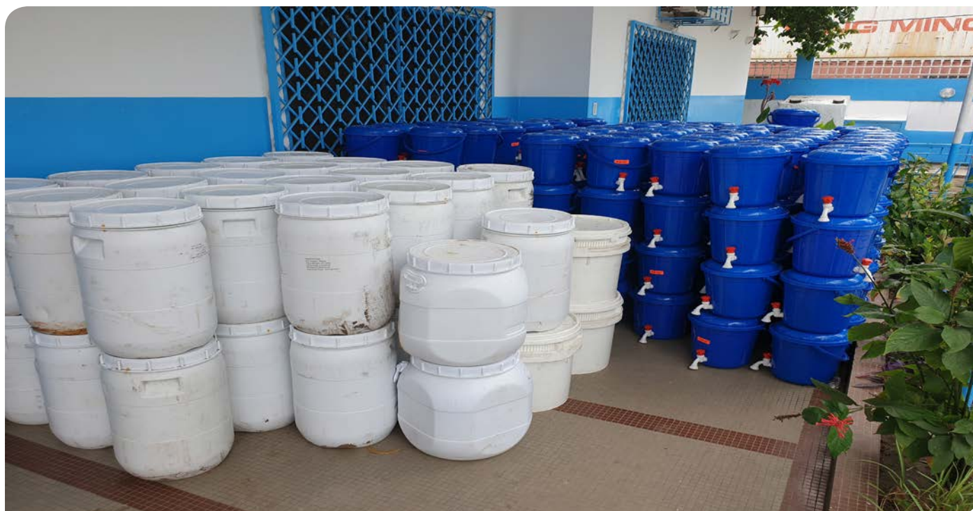
Above: Handwashing devices for distribution. The AIRD team in the Republic of Congo has been entrusted with promoting good sanitation habits in various refugee camps through distribution of various items, as well as through undertaking trainings.

To improve access to safe water, our program in DRC drilled 13 new boreholes and also rehabilitated 15. In Burkina Faso, 20 boreholes were rehabilitated to ensure water safety. The programs also supported water quality tests to guarantee safety. In the Republic of Congo, the results from the water points revealed that the physicochemical and bacteriological qualities of water are acceptable and guarantees public health in accordance with WHO quality standards. For all open wells, chlorination was done regularly to guarantee safety for consumption.