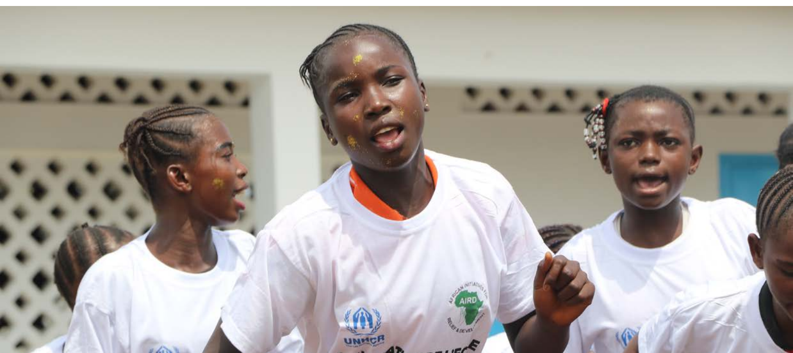
Cover photo- A dance to celebrate the inauguration of Bouemba Primary School in the Republic of Congo following rehabilitation work by AIRD.