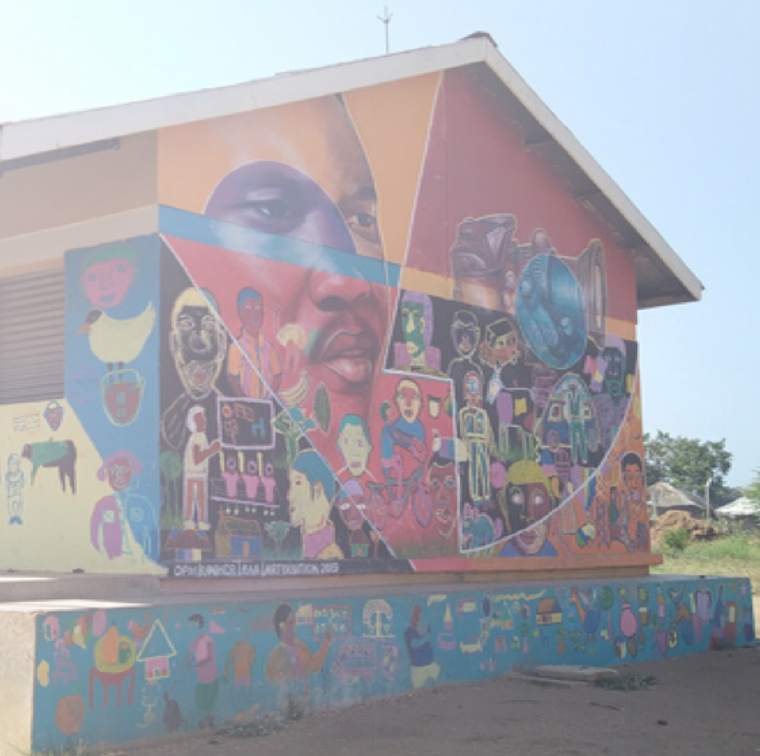
Above: One of AIRD's constructions is Alaba Primary School, BidiBidi in North Western Uganda