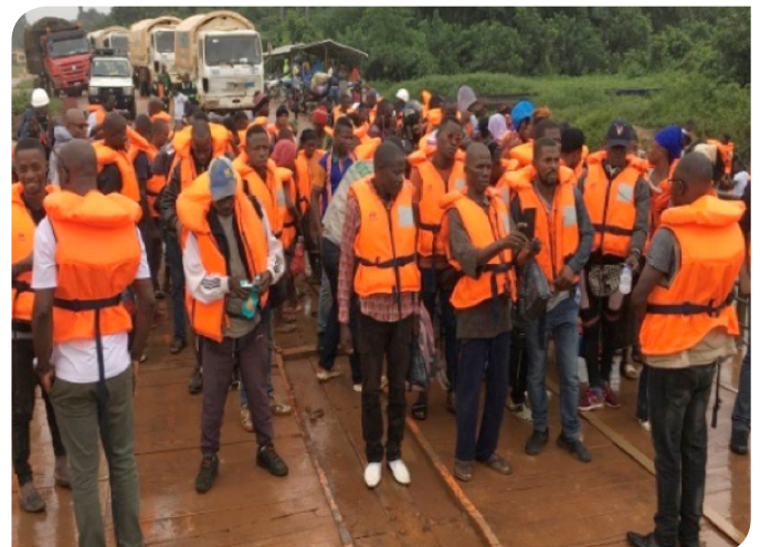
Voluntary repatriation of Ivorian refugees from Liberia through a transit centre in Tabou

Returning home is very important for many displaced people. In 2019, 855 refugees were repatriated from Burkina Faso to their home country in Mali. In Cameroon, 1,190 refugees were transported from Lolo refugee transit center to Berberati in the Central African Republic. In the Central African Republic 12,218 Central African refugees were repatriated from Betou in the Republic of Congo to Mougoumba in the Central African Republic.