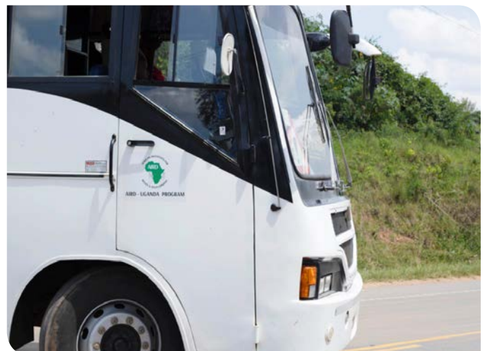
Buses are regularly used across all AIRD operations to transport refugees to transit and settlement camps

We appreciate the importance and value of utilising technology to improve the way we work. In that regard, we are pleased to have worked in partnership with UNHCR to introduce the FleetWave management system in 2019 in some of our programs. FleetWave will allow for easier monitoring and reporting on the entire fleet of vehicles we manage including aspects such as total numbers and maintenance status. The system also enables easy and timely reporting through improved and enhanced data management within the system.