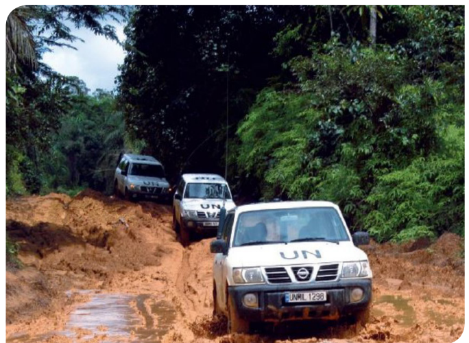
AIRD fuel stations and distribution enables the movement of partner vehicles across any distance

In looking forward towards environmentally sustainable alternatives, we are pleased to work with our donors in making these options a reality. As an example, the AIRD Burkina Faso program was tasked with putting in place a supply chain mechanism to distribute domestic energy items (gas bottles) to refugees and to further install, monitor and rehabilitate solar energy equipment. The outcome of the activities that have been implemented in Goudebo and Mentaou included 8,916 gas refills benefitting 1,486 families and 287 improved stoves being repaired. Environmental protection and sustainability is of the utmost importance and we look forward to increasingly working on initiatives such as these across our programs.