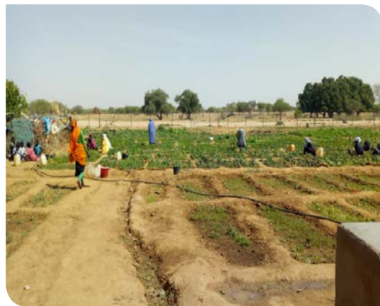
Above: Market gardens in Chad supported by the AIRD team. These provide additional food and income for refugee and host communities.