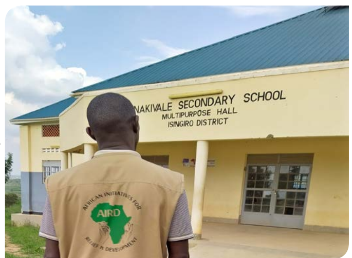
A staff member looks on at one of the buildings worked on by the AIRD program in South Western Uganda

In terms of rehabilitation works AIRD helped to restore 35 boreholes, 13 bridges, 1,301 emergency shelters, 167 latrines with sanitary facilities, 356 kilometres of roads and 1,010 transitional shelters among others to improve on the movement and accommodation needs of the People of Concern. The different construction and rehabilitation works have continued to support People of Concern with clean and safe water, eased their movements, improved accommodation facilities, and other basic social services leading to improved living conditions. Importantly, provision of sanitation and hygiene facilities helped to promote cleanliness within the refugee settlements resulting in reduced cases of disease outbreak in the year. Shelters contributed to reduction in common safety and protection related risks in settlements camps that mostly affected women and girls. The construction of learning centres enhances opportunities for refugee and host community children to receive a decent education.